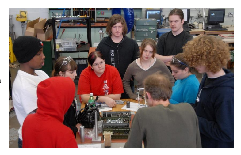
Students study a manufacturing process at a community college.

Two-year programming is a niche that the Erie County Community College would help to fill. And the community college, among many other offerings, would serve to meet the specific needs of employers through targeted curriculum and training programs.